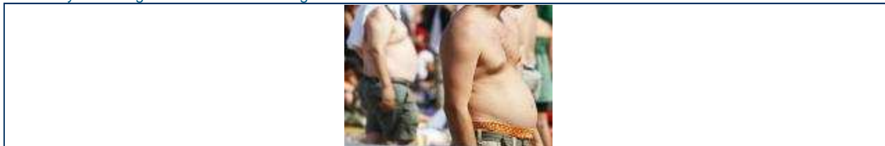
Will Americans put on "recession pounds"?