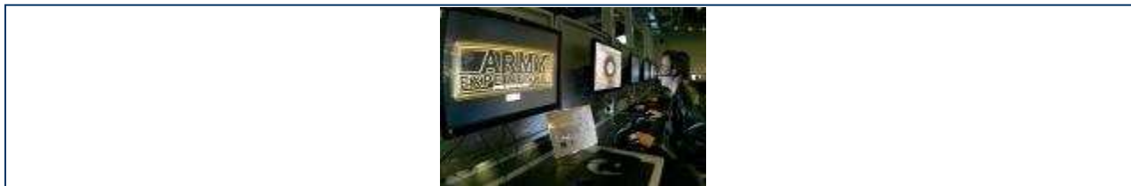
U.S. Army recruiting at the mall with video games