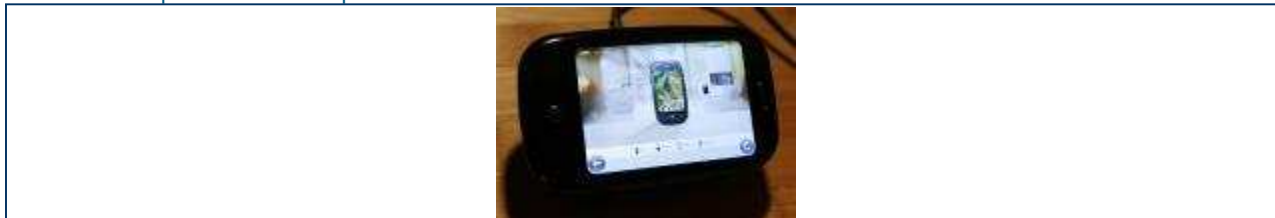
Palm debuts "Pre" smartphone at CES in Vegas